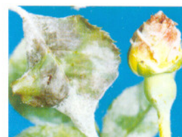
Roses Powdery Mildew

Baycor® is a registered trademark of Bayer CropScience