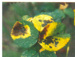
Black Spots in Roses